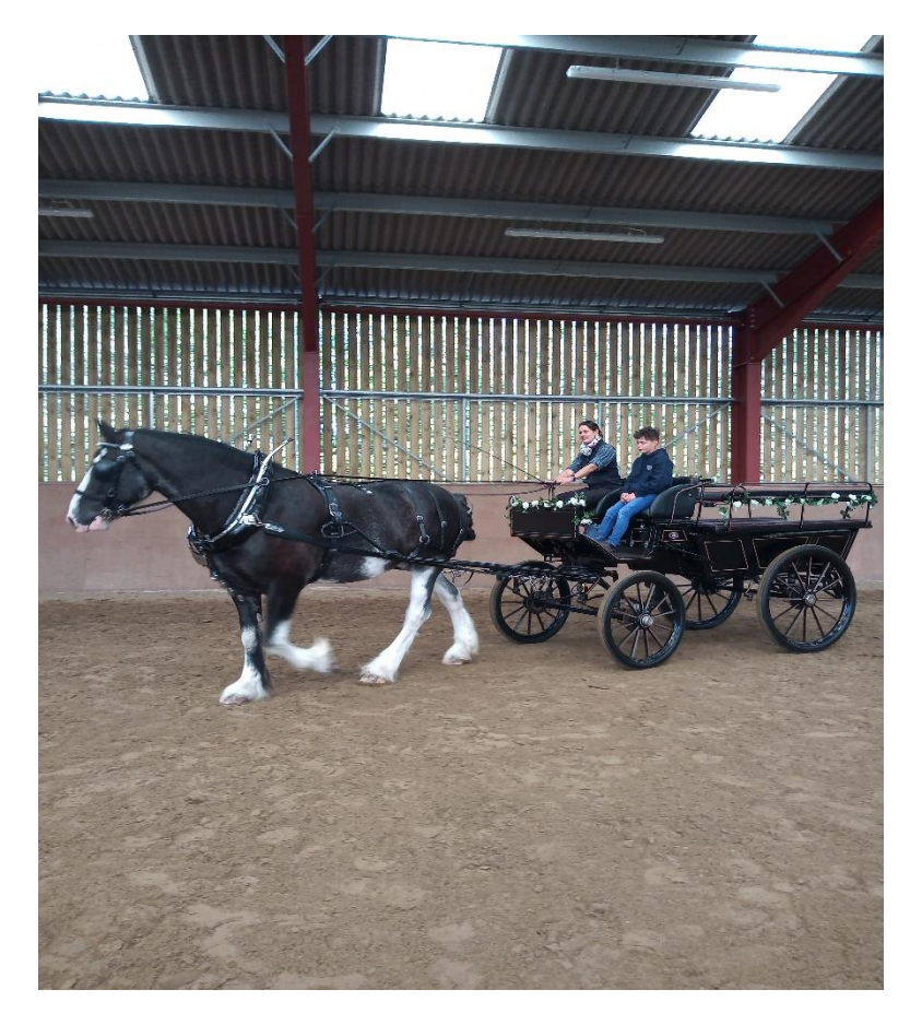
Before I go any further I am absolutely certain we will see this young man above at our 40<sup>th</sup> Anniversary Show Day on Saturday 1<sup>st</sup> July 2023 as a new young handler.